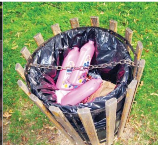
Local kids seemed to want to help wash the fountain after a summer season of enjoyment, and donated three bottles of Mr. Bubbles. Surely not as entertaining for the Public Works Department, which had to clean up the prank.