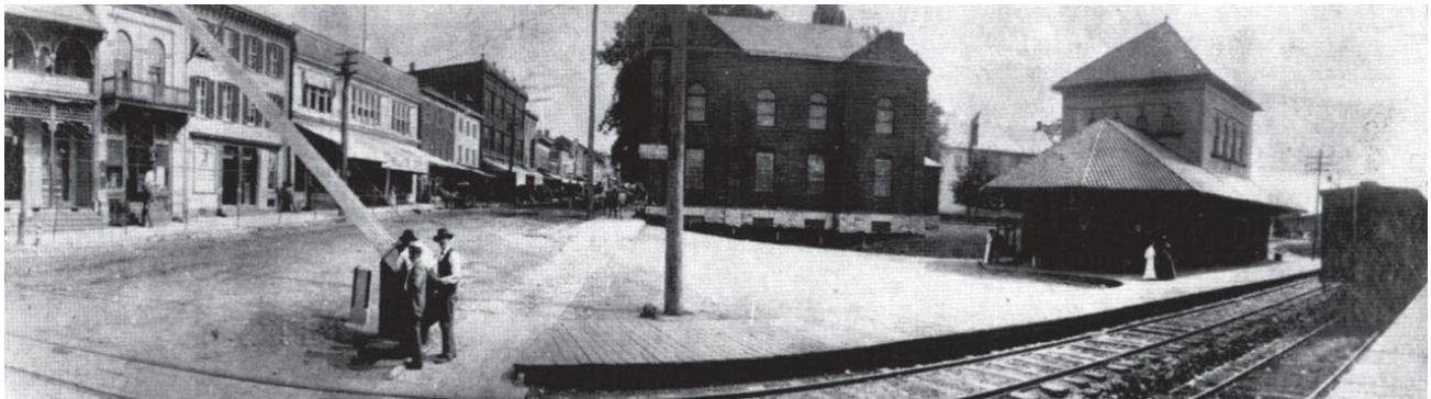
The railroad came to Westminster with the arrival of the Western Maryland Railroad in 1861. The tracks crossed Main Street near Liberty Street. This panoramic view looking east on Main Street was taken c. 1900.