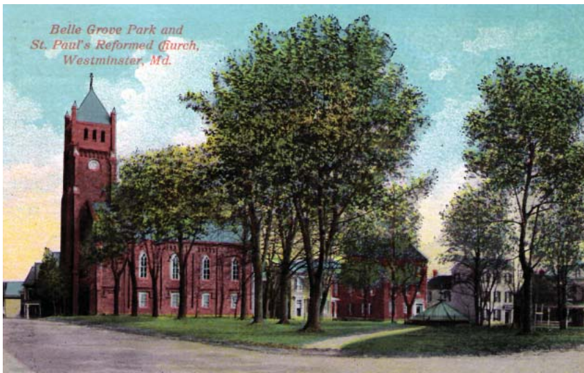
Belle Grove Park and St. Paul's German Reformed Church are shown in this postcard from the 1920s. The fountain is shown in the middle of the square.