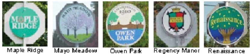
Some examples of other neighborhood association signs are depicted shown mounted on the backs of city stop signs around neighborhood boundaries.

the City of Westminster. After getting official recognition from the city of Westminster, the next step will be to get street signs installed at the borders of our neighborhood. We have visited with city officials about this plan and they are working on a sign ordinance regarding the installation of neighborhood signs. The city has expressed an interest in helping us with this plan. They have suggested possibly installing some type of signage atop existing street signs. We are also looking into the possibility of installing signs on the back of existing stop or other street signs. It is estimated that we will only need about five or six signs and the cost is not yet known.