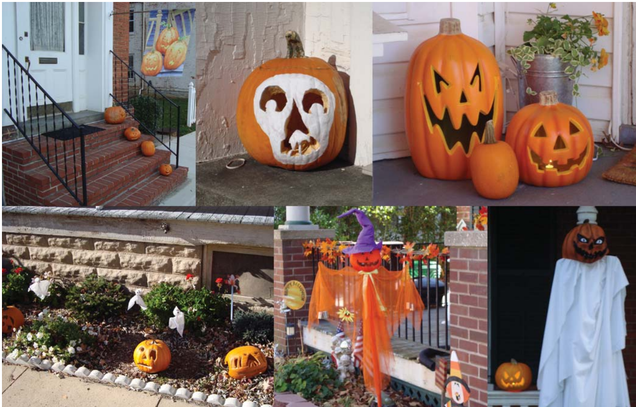
Belle Grove Square area residents showed some Halloween "spirit" in decorating for the holiday.