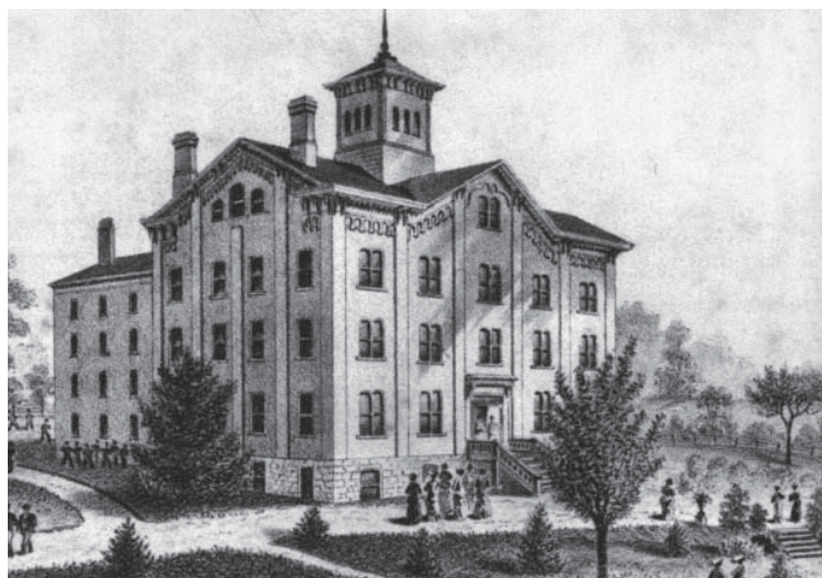
This lithograph shows the Main Building in the early 1870s.

In 2002, the Board of Trustees changed the name of the college