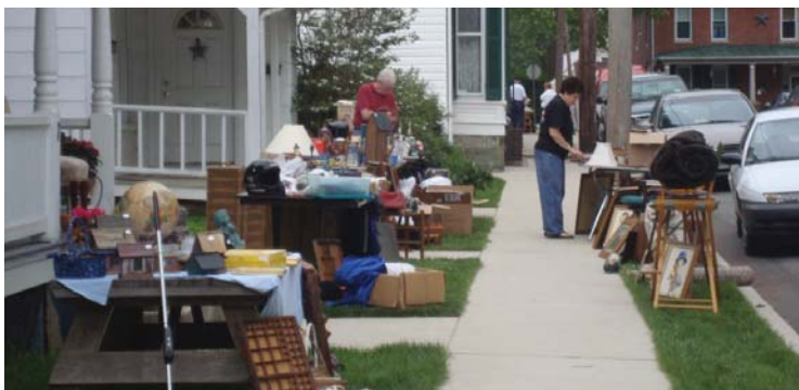
Belle Grove Square neighbors set up for last year's yard sale.

As most of you have noticed, our neighborhood is having most of its streets resurfaced. Bond Street was the first to get paved and the street looks great. Revenue to fund our street repairs comes from a 14 cent tax increase that was enacted last July. The money raised from the tax increase is used only for capital projects. Much thanks to the City of Westminster for their work and