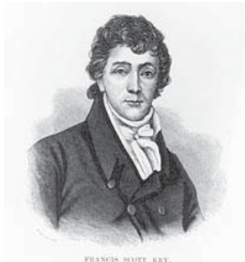
FRANCIS SCOTT KEY.

The General Federation of Women's clubs clubwomen are true volunteers in action—in 2010, members raised nearly $40 million doing more than 185,000 projects, volunteering more than 8 million hours in the communities where they live and work.