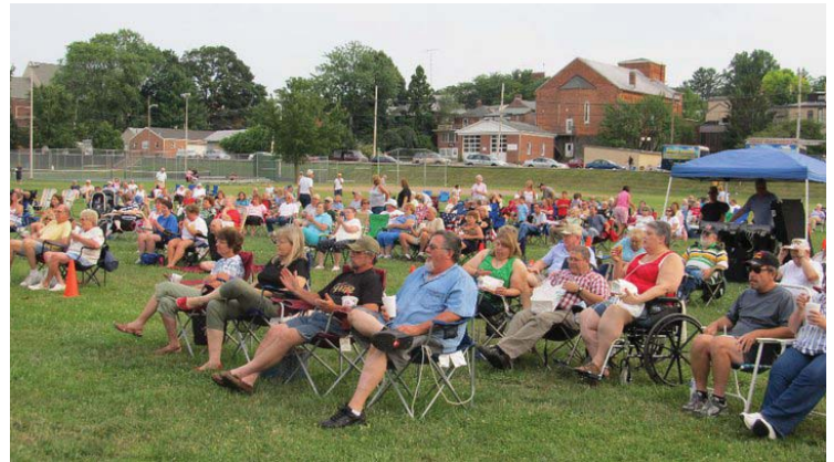
Revelers gather at Westminster City Park for summer concerts.

Neighborhood residents along with local city and law enforcement officials will gather under the shade trees at 6:00 to share some delicious ice cream. Local residents are encouraged to bring a favorite topping and join us as we enjoy an evening of sweet treats in our historic neighborhood park.