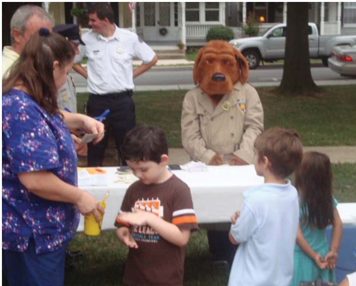
McGruff the Crime Dog meets with neighborhood kids at Belle Grove Square park on National Night Out in August 2010.

The event is meant to increase awareness about police programs in communities, such as drug prevention, town watch/ Neighborhood Watch, and other anti-crime efforts.