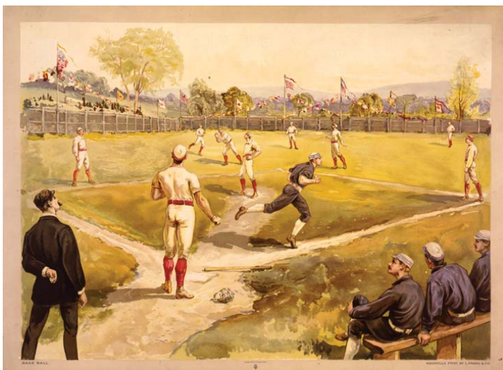
Color print of early Baseball game. Legend reads, "Base Ball. Aquarelle print by L. Prang & Co."

It is believed that our park hosted baseball games before the fountain was added in 1893.