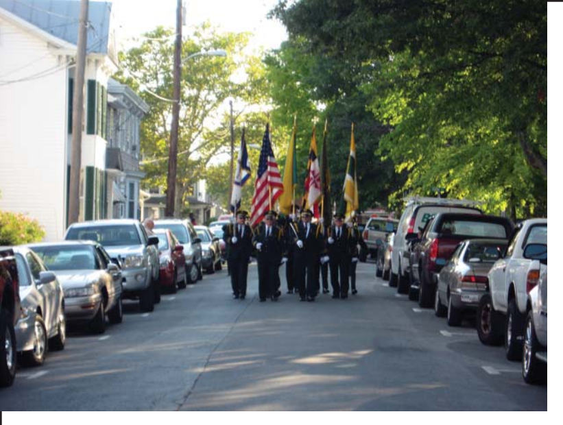
Color guard of Westminster Municipal Band marches down Park Avenue to Belle Grove Square on Sunday August 24, 2008.