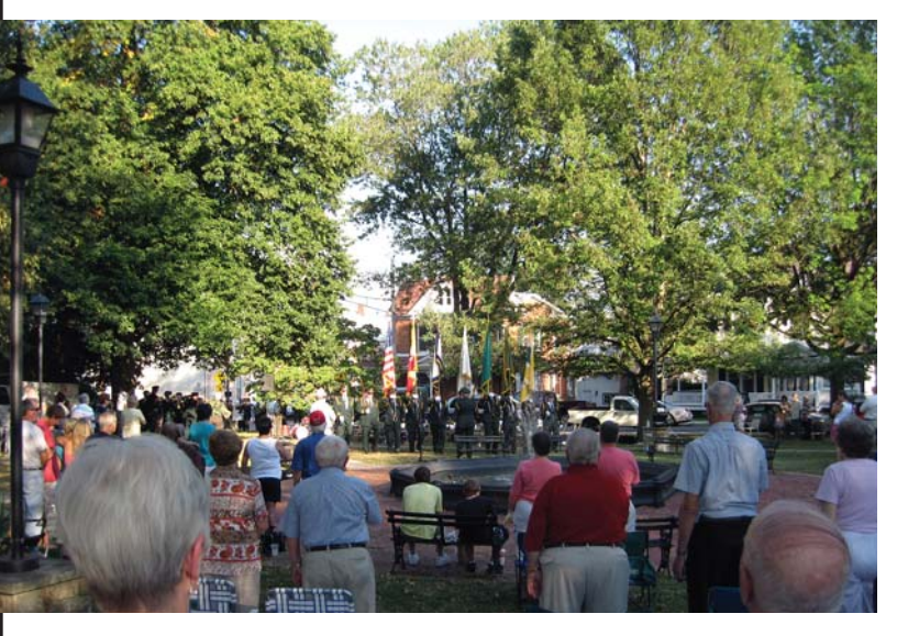
Attendees stand respectfully at attention as flags are presented in Belle Grove Square before the Municipal Band's 2008 concert.