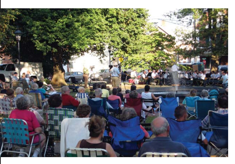
Turnout was great with residents from all over Westminster for the 2008 Westminster Municipal Band Concert in the park.