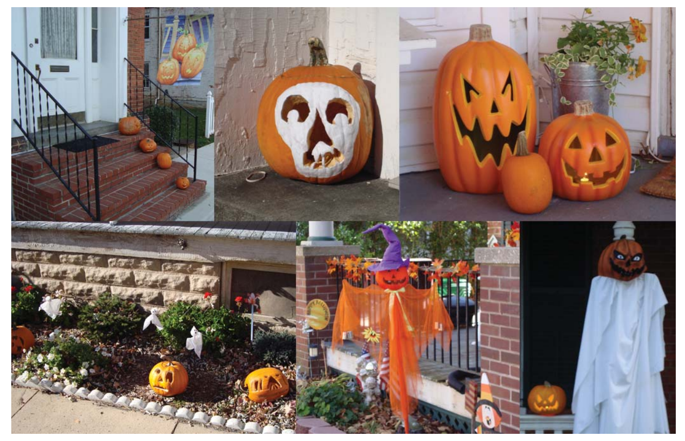
Belle Grove Square area residents showed some Halloween "spirit" in decorating for the holiday.

Some examples of other neighborhood association signs are depicted shown mounted on the backs of city stop signs around neighborhood boundaries.