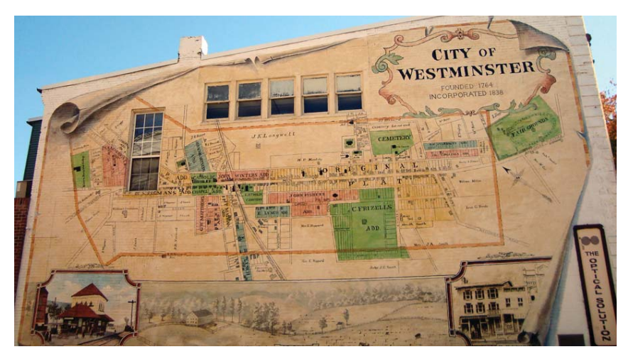
Westminster map mural depicts early city history at Locust Park

As one of its first projects, the Historic Belle Grove Square Neighborhood Association has volunteered to make the luminiers that will help light they way to the homes on the tour. We will be gathering on one of the Saturday's in mid November to make the luminiers and all those who volunteer to help will receive a free ticket to the home tour. Please call us at 443-293-7203 if you would like to help make the luminiers for the home tour.