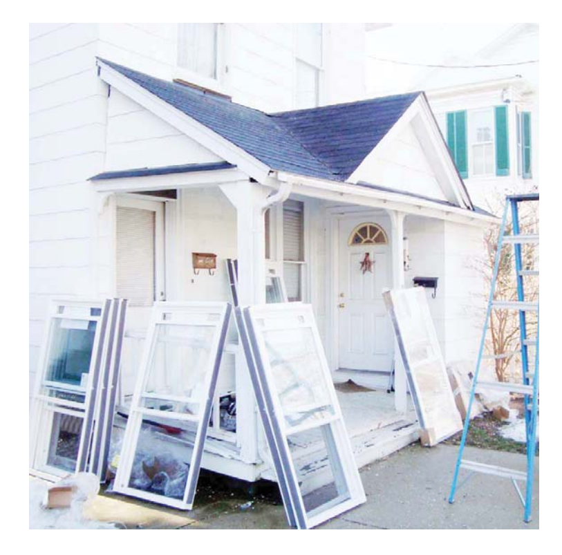
Workers prepare to install new windows at a neighborhood home.

Editor's Note: as reported in the Hanover Evening Sun October 15, 1964