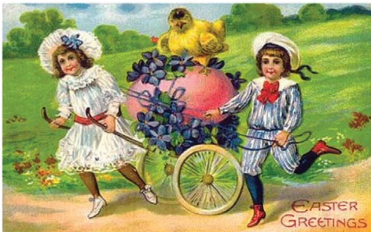
An Easter postcard is depicted from the late 1800s.

A secular tradition that may have a long tradition in Carroll County is that of dyeing eggs in many colors for Easter. It was a custom amongst the Pennsylvania Germans and