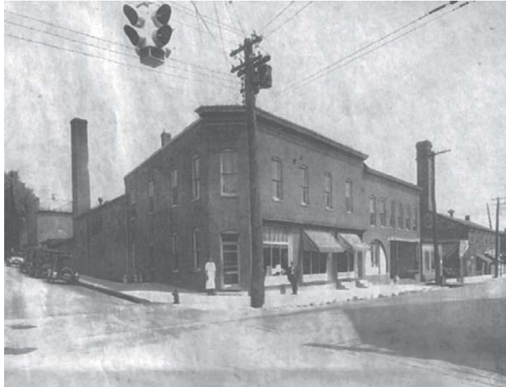
The corner of Green and Liberty is shown before World War II.

Liberty and Green streets was a very quiet spot as a steam mill was the only industry in the immediate neighborhood, but with the building of the Koontz creamery