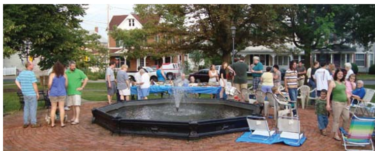
Belle Grove Square neighbors gather and visit at the start of the neighborhood picnic in the park last year, July 24, 2009.

Get ready for an evening of historic entertainment: on June 18, 2010 our neighborhood's city park will be the site for authentic late 19th century music. The Newmont Military Band honors the tradition