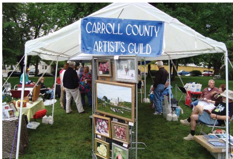
Artists gather to set up for last year's Art in the Park near City Hall. Admission is free and this year's event will be held June 5.