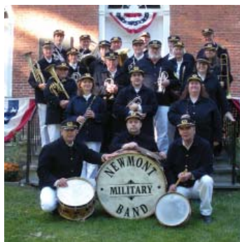
The Newmont Military Band poses during an appearance at Center Church, Weathersfield, Vermont, Sept. 20, 2009.

of brass bands in America, as a re-creation of a small-town brass band of the late 1800s. Their program is representative of the music played on the town green in the late 19th century. There are songs of "the war," songs of love, marches (including Sousa's), dances, and songs from the old plantations. Musical selections are chosen from American Band and Windsor Military Band programs documented in the Claremont Advocate and the Vermont Journal between the years of 1890 and 1905.