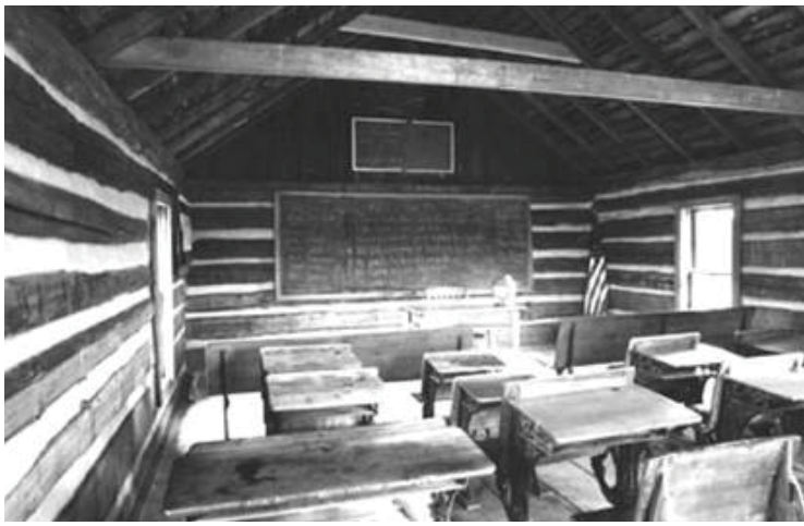
A one room school house is depicted circa 1895.