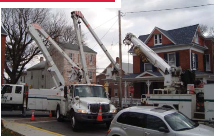
Power and utility poles are in the process of being repaired and upgraded all around Westminster this year by BGE crews.