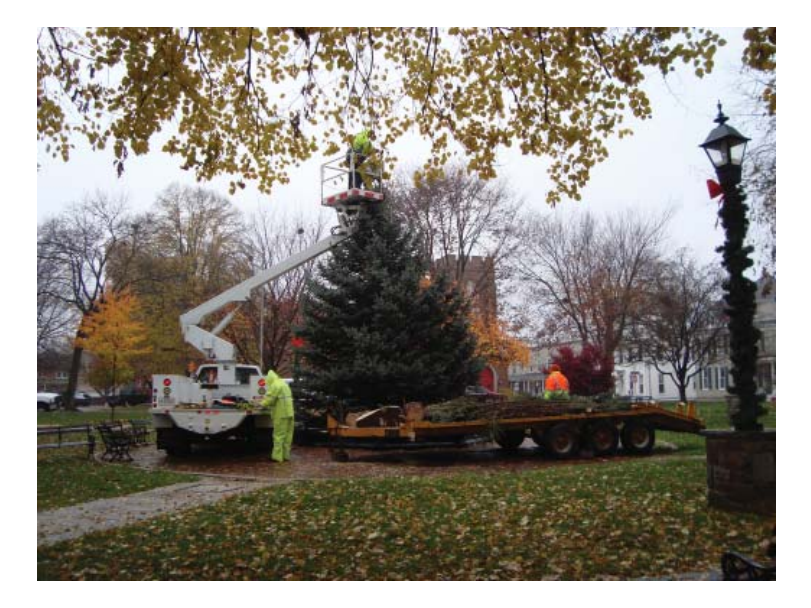
City of Westminster Public Works Dept. raised the bar this year with a huge tree placed in the park's fountain Nov 16, 2010.