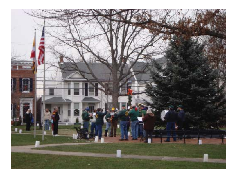
Westminster Municipal Band and many others performed to help make the Dec 11th tour an enchanted evening all around the square.