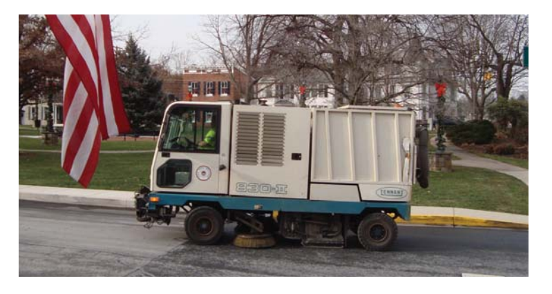
Belle Grove Square's never looked as clean as after the city's special efforts in the days leading up to the home tour Dec 11.

Our home tour wouldn't have been the success it was without the hard work of a great many folks. First and foremost, a big thank you to the