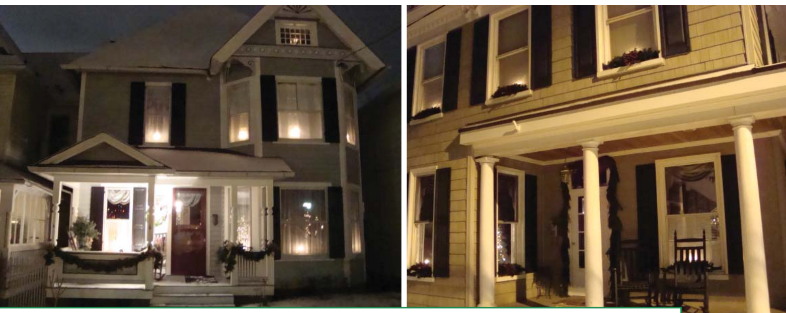
really went all out around the square in 2010 to decorate in advance of the Holiday Home Tour held December 11, 2010.