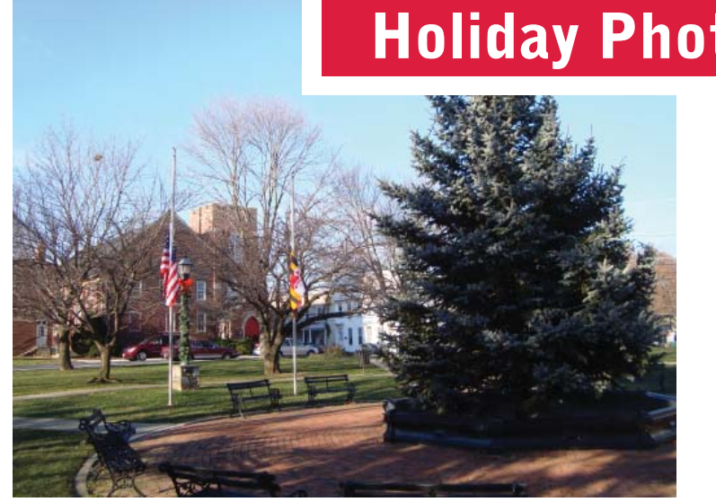
The American and Maryland flags fly at half-staff in the square on Dec 7, 2010 in honor of the 69th anniversary of Pearl Harbor.