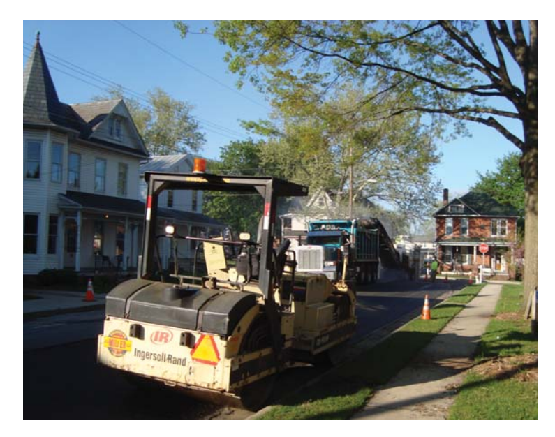
A road crew works to mill and repave Park Ave in April 2011.

Relocating over the years from the Odd Fellows Hall to the new Times Building and then to the second floor of the Wantz