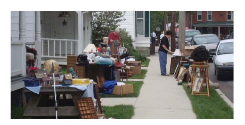
Belle Grove Square neighbors set up for last year's yard sale.

The Flower and Jazz Festival takes place in Historic Downtown Westminster from 10:00 a.m.-4:00 p.m. on May 7th. Delicious food and great entertainment will be offered and local nurseries set up beautiful displays of unusual plants and shrubs. Over 100 craft vendors display a wide variety of unique items. Admission and parking are free. The Flower and Jazz Festival is preceded by a Fun Run with a 200 yard dash, one mile fun run and a timed 5K.