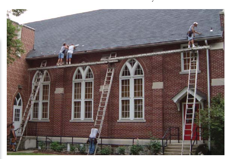
Workers install cleats on the roof of Westminster Church of the Brethren on Belle Grove Square to protect against falling ice.